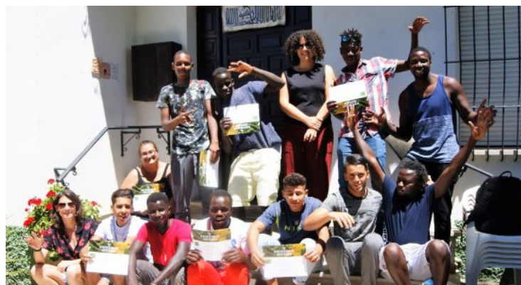
The final day of Cultivando Futuros training, whose participants grew the food eaten during Refugee Week

Productus de la Bolina: launched in 2018, this includes a veg box scheme and consumer group, selling our vegetables in