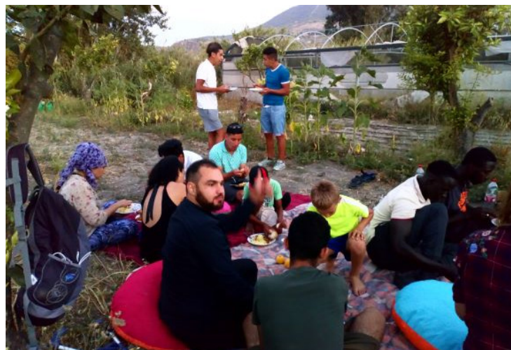
Preparation Refugee Week - sharing ideas with members of Association Dar Al Anwar

The project's vision is to create a cooperative of thriving multicultural sustainable enterprises in El Valle in the province of Granada, Spain whilst regenerating the ecosystems and economy of the area.