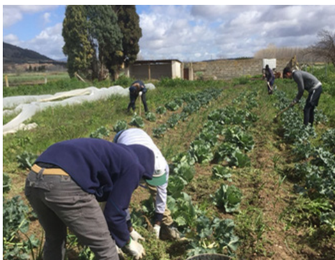
The first harvesting and selling

The La Bolina core team met in an Eroles Project residency in Spain where 16 people from all over the world (including international development workers, artists, lawyers, migrants, permaculturists, farmers, activists, and academics) gathered to bring their knowledge together to create an integrated, holistic approach to borders, climate change, new economy, human rights and migration. A shared vision and set of values emerged, along with a deep understanding of each other and a commitment to radical friendship. This resulted in the group deciding to live, work and develop La Bolina together. After a year of site visits to depopulating villages in Granada province in a search for the project's long-term base, the municipality of El Valle fitted the project's criteria (proximity to a city, local services, school, public transport, severe depopulation, empty building & available land), with a welcoming response from the local council and local people. The team moved to El Valle in late 2017, and have focused on understanding and becoming fully engaged with what is happening at the local and regional level in the fields of regeneration, sustainability, social economy and migrant integration and is adapting the project's model in response.