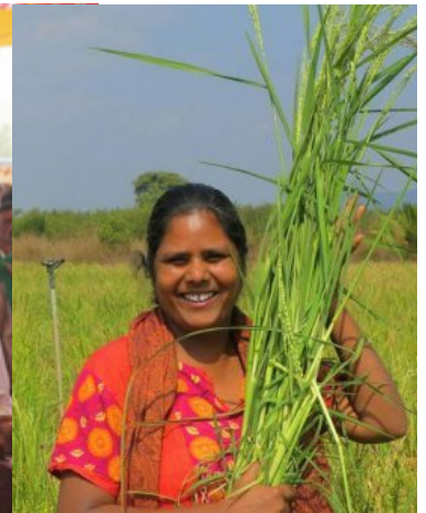
Campaigning is linked to basic and in-depth agroecology and ZBNF training, delivered at the Amrita Bhoomi training centre and demonstration farms.